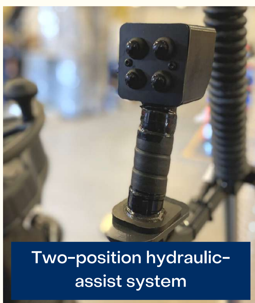
Two-position hydraulic-assist system